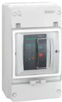
BDM-125 with IP65 Enclosure